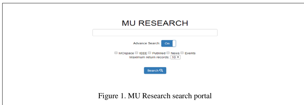
Figure 1. MU Research search portal

Key word search is supported from specific data resources or whole data sets (Figure 1). The search procedure is implemented as we originally designed based on the backend indexing and multiple databases. The results are sorted by the initial ranking of the search system we build. We are further optimizing the ranking algorithm. The corresponding MU researchers or contacts for certain research topic are then recommended by our system. The student as our valued user can initialize a chatting with any of the suggested contacts (Figure 2).